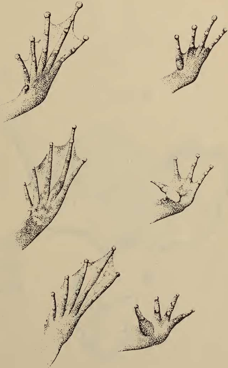
Fig. 1. View of foot and hand of Litoria aurea (top), Litoria raniformis (centre) and Litoria flavipunctata (bottom).